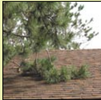
Trim all overhanging branches.