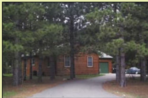
Log home in pines.