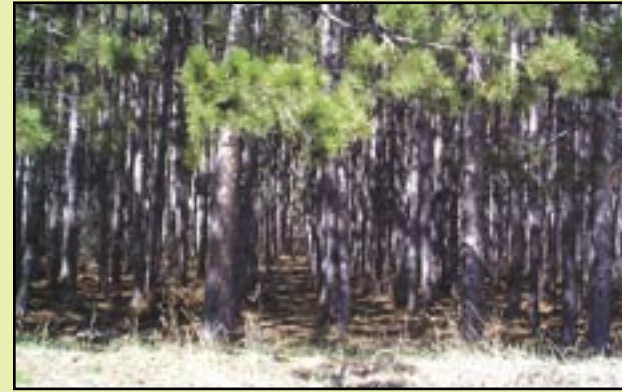
Pine rows need to be thinned.